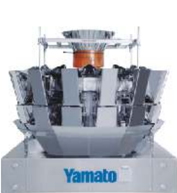
The new basic Alpha models

While its basic composition remains the same, the new "Alpha" now additionally features models for fresh produce and IQF applications, as well as specialized machines for pasta products, dusty products, etc.