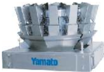
The new waterproof Alpha models